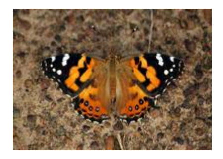
Australian Painted Lady

Australian Painted Lady / Blue-spotted Lady - Vanessa kershawi One of the first to emerge in spring, the Painted Lady has white spots on the black section of the upper wings, the rest of the wings being black and brown. There are small blue spots on the lower wings - hence its common name. They fly rapidly and often, settling with wings partly