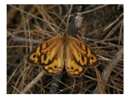
Common Brown - male

Males are duller and fly close to the ground in early spring, flying higher later in the season. Females are larger, with the brown colour showing more contrast. They have yellow markings towards the edges of the upper wings, and are more active in autumn. They are found in forests, urban areas and grasslands, and can be seen from September to March. This butterfly reproduces once a year.