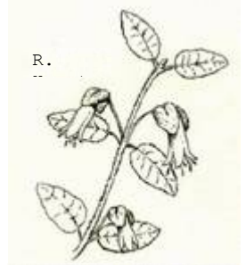
Correa reflexa var. reflexa

The flowers of Common Correa Correa reflexa var. reflexa and Eastern Correa Correa reflexa var. speciosa are red with greenish tips or yellowish-green. The obvious difference is with the two, paired leaves at the base of the flower. Variety reflexa has the leaves facing towards, or clasping the flower, and in variety speciosa , the two base leaves face away from the flower.