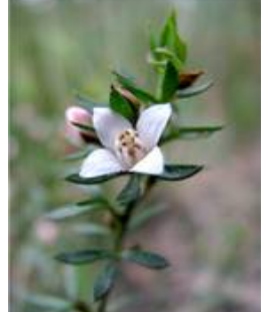
Boronia nana var.

and this scent may protect the plant from herbivorous animals. The flowers have four petals and eight stamens. The fruits contain hard, waxy seeds.