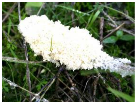
Slime Mould found at Pt.Roadknight

Have you ever heard of Slime Moulds or Water Moulds? Probably, without realising it, you have, at least the latter.