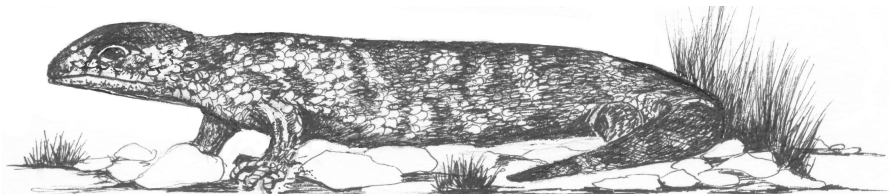
Blotched Blue-tongue Lizard

Blotched Blue-tongue Lizards are conspicuous and common visitors to our gardens, and are much loved by children and adults alike. They are generally placid, but will warn you, with a loud hiss and an impressive display of their blue tongue and open mouth, should they feel otherwise. Being reliant on the sun for warmth, Blue-tongues have recently begun hibernating under dense, leaf litter, or inside hollow logs. They will begin to emerge in mid-to-late spring, when they will seek the warmth of the sun and rocks. Unfortunately, the warmest rocks around are the bitumen roads, so please take care at that time of year! This species is viviparous (giving birth to live young), and females display a multiennial breeding cycle, often skipping one or more seasons after giving birth to 2–15 young. The Blotched Blue-tongue is distinguished from the Eastern Blue-tongue T. scincoides by having blotches on its skin, instead of stripes.