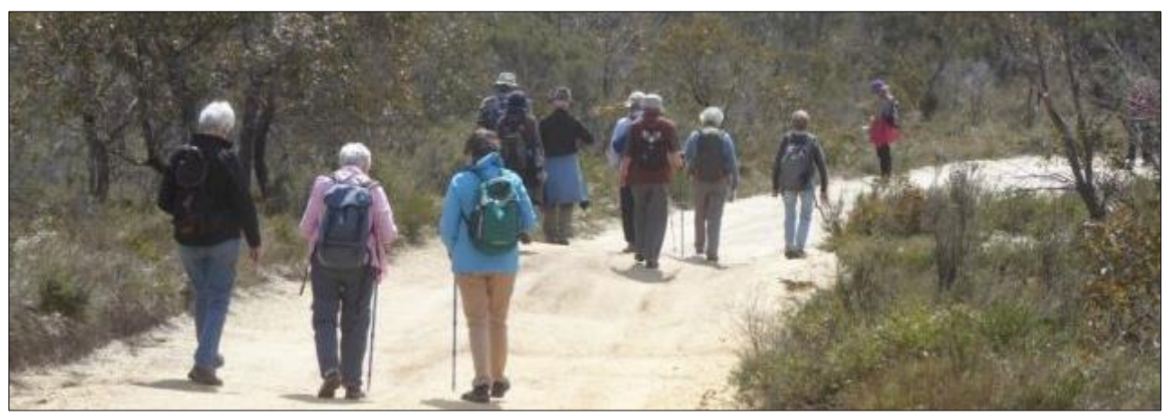
Top: A well-deserved lunch break on Boundary Track. Above left: Out came the sun and the group enjoyed watching the sun orchids respond. Above right: Looking across the heathland at the mine site. Bottom: Following Boundary Track into the valley.

stepping out along the much eroded track back to Bald Hill Rd. We all agreed it had been a very enjoyable walk. Alison Watson