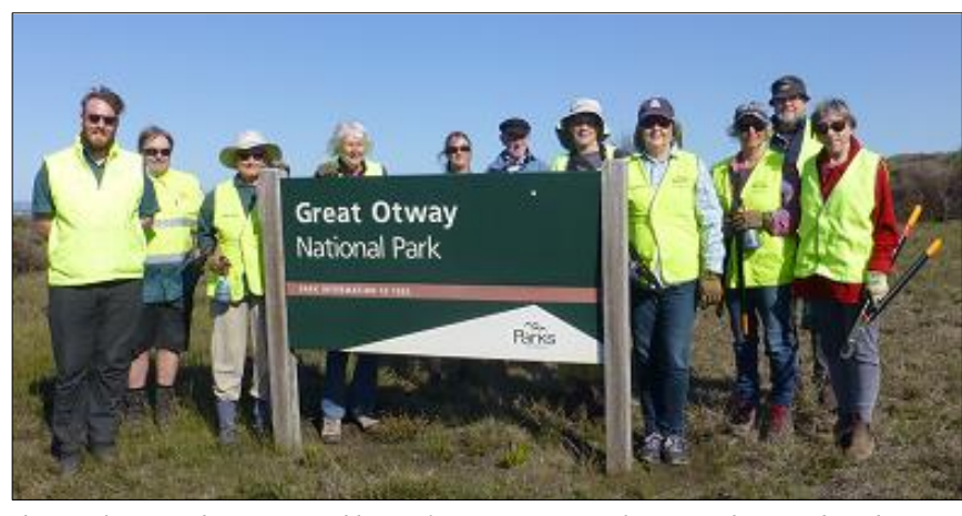
Above: The Friends were joined by Parks Vic rangers at the September weeding day.

Our session on October 9 was carried out in moist, misty conditions but our enthusiastic workers continued regardless – it was a pity the sun was not out as we found many of our sun orchids scattered through the area where we were weeding. Unfortunately we also found two South African weed orchids Disa bracteata (at right) that were quickly removed. Another concern appears to be a hybrid Silky Tea-tree/Coast Tea-tree that was in full bloom (pictured below).