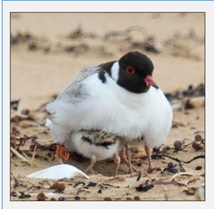
Above: Back in residence - WT with chick at Hutt Gully January 2017.