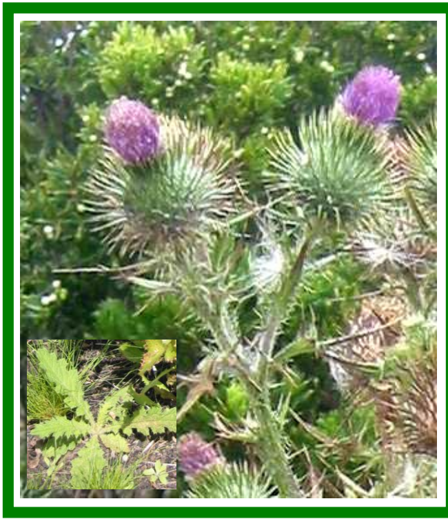
SCOTCH (SPEAR) THISTLE

For information on identification, control or removal, contact the Great Ocean Road Committee on 5261 2496, ANGAIR on 5263 1085 or Anglesea Coast Action on 5263 3327.