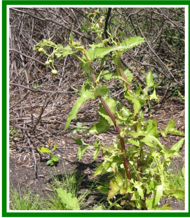
MILK (SOW) THISTLE