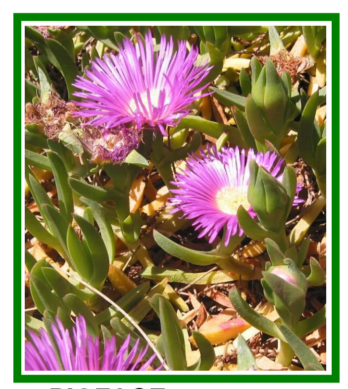
PIGFACE (INTRODUCED ONE)