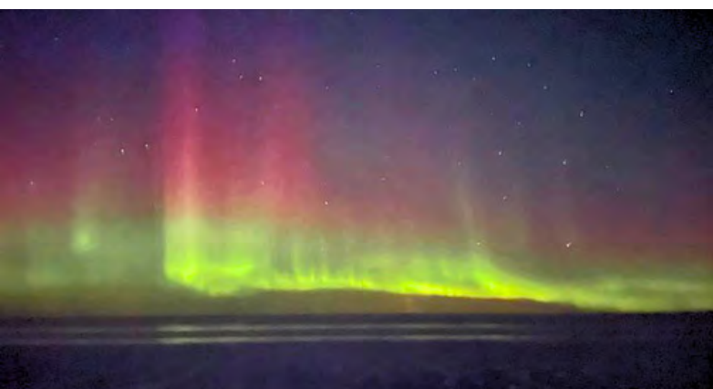
Pete attempts to dance around the full Antarctic Circle, while some friendly Adele Penguins look on suspiciously, and the amazing Southern Lights - Aurora australis.

The chance to check out McMurdo was a real bonus for us, located on Ross Island with spectacular mountains and the huge Ross Ice Shelf adjacent. At the station there are views of the smoking volcano of Mount Erebus and the chance to visit the Discovery Hutt built by the Scott expedition in 1902. A huge operation with a population of 940 when we were there, the station is like a small town and services the other US Station at South Pole as well as being close to the NZ Scott Station and the Italian Zucchelli Station.