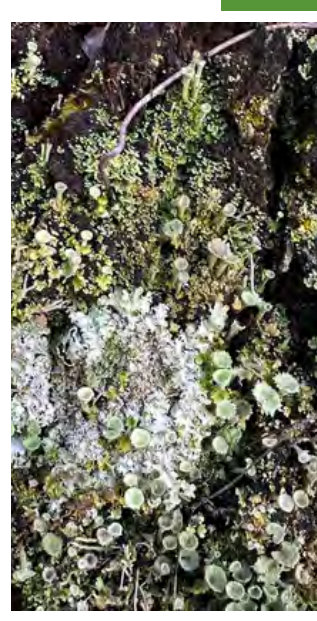
A mosquito orchid and interesting lichen

There were other interesting things to observe, large mushroom-type fungi on the edge of the burn, just glistening in the sunlight; a fascinating bracket-type fungi that looked like a bell on the trunk of a tree; ant nests that had obviously been built up to cope with oncoming rain; some brilliant patches of Victoria's floral emblem, Common Pink Heath, and buds of Tall Greenhoods appearing.