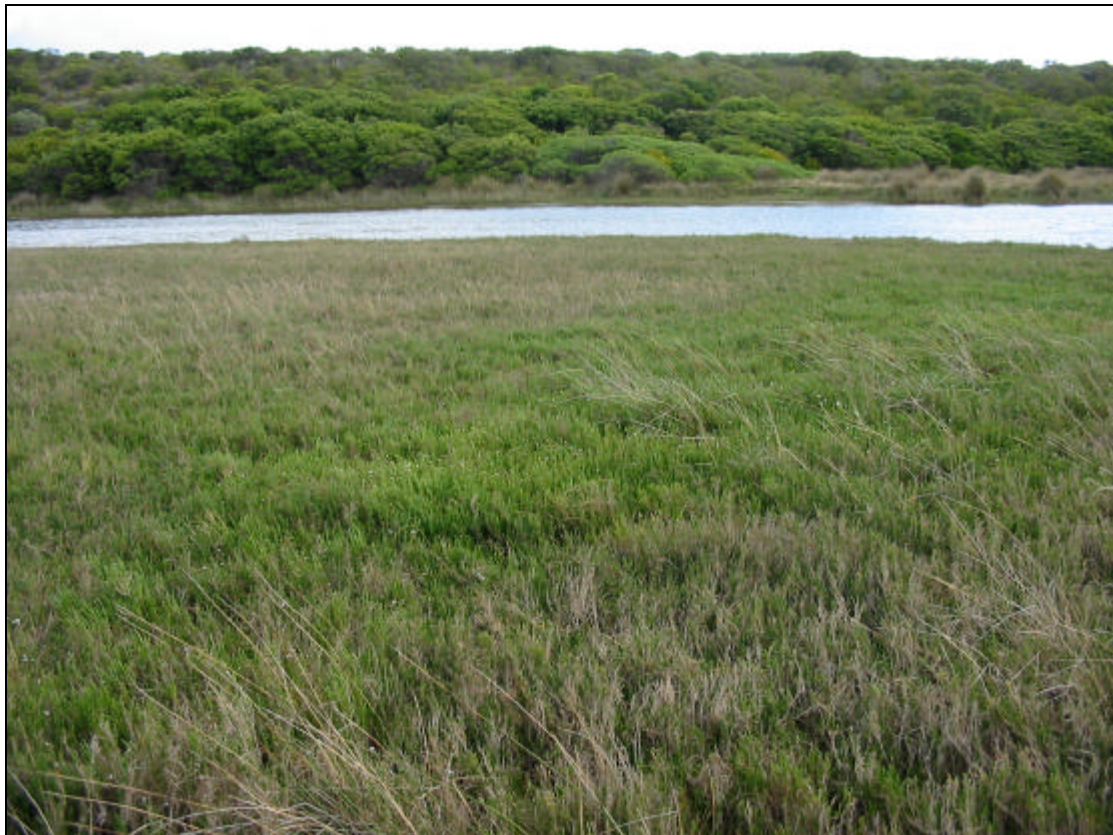
Figure 2: Coastal Saltmarsh (EVC 9) (Foreground); Coastal Alkaline Scrub (EVC 858) (Background on lower dune)