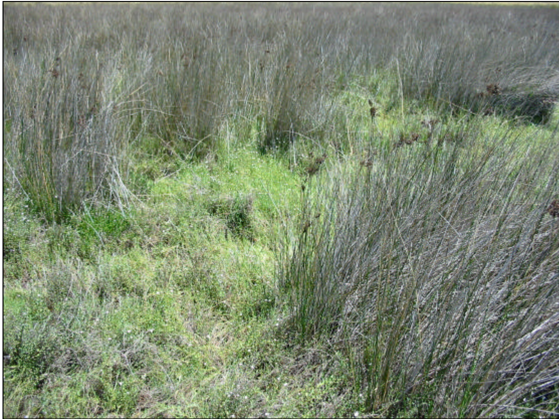
Figure 3: Estuarine Wetland (EVC 10).