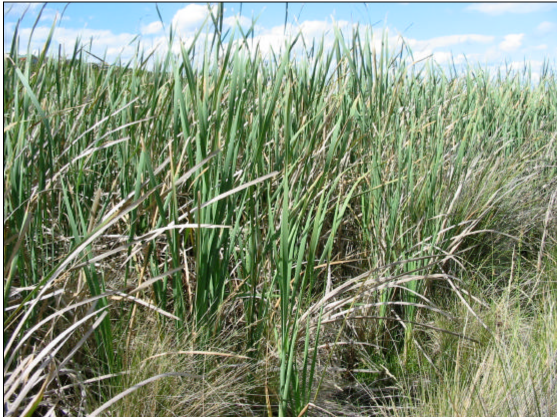
Figure 7: Tall Marsh (EVC 821).