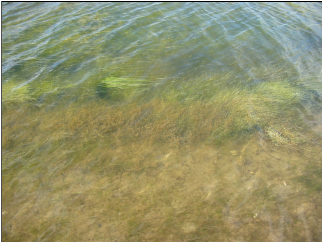
Figure 1: Saline Aquatic Meadow (EVC 842).