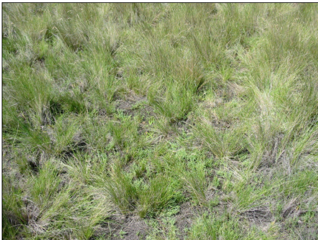
Figure 6: Brackish Grassland (EVC 934).