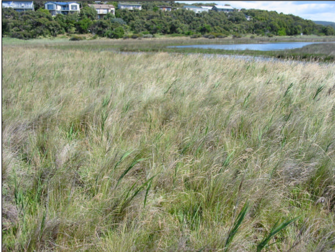
Figure 5: Estuarine Flats Grassland (EVC 914) (Foreground).