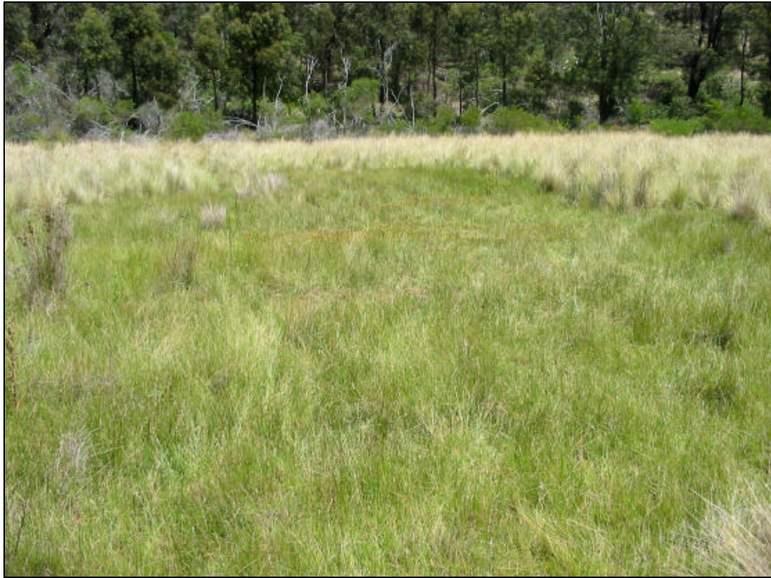
Figure 8: Spike-sedge Wetland (EVC 819) (Foreground).