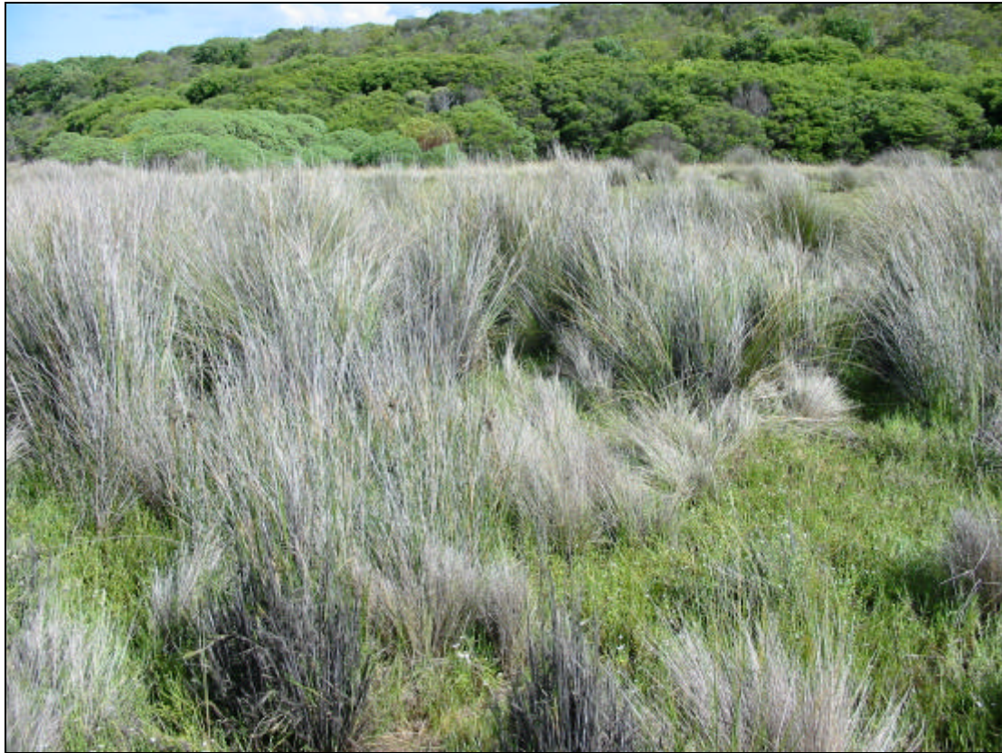
Figure 4: Brackish Sedgeland (EVC 13) (Foreground).

Local extent: 1.00 ha (EVC 13.1: 0.32 ha, EVC 13.2: 0.68 ha)