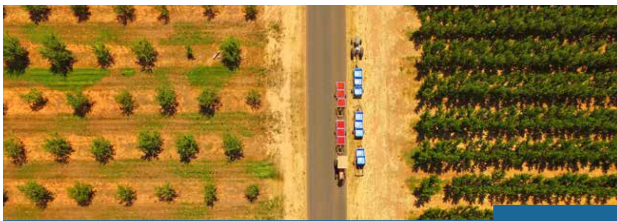
Aerial view of apple orchards