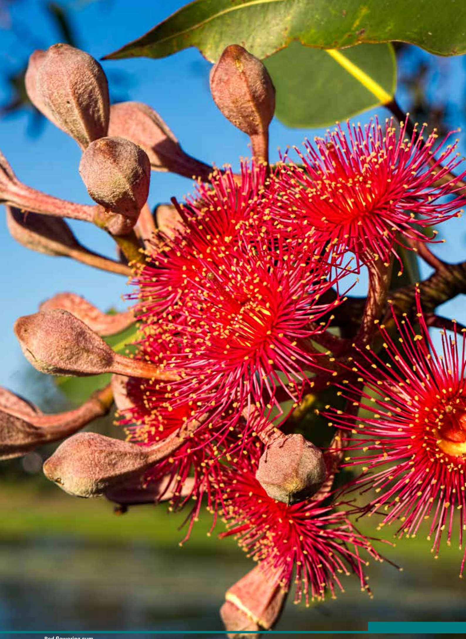
Red flowering gum