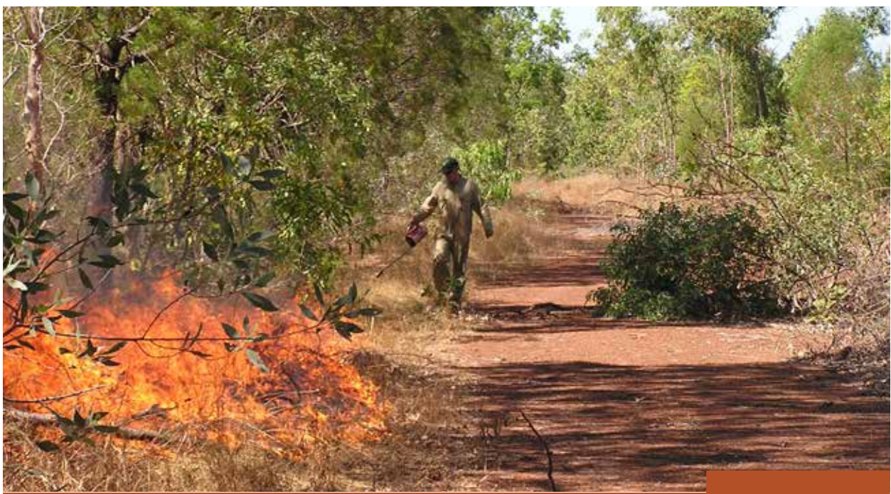
Indigenous Ranger, controlled burning

Reforms to First Nations cultural heritage legislation will be developed in parallel with reforms to the national environmental law. The interrelationship between these two areas of reform work, and the need for these pieces of legislation to work together, will be considered as part of both reform processes.