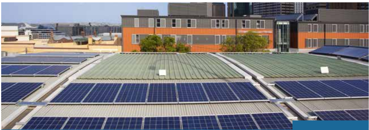
Rooftop solar panels, Sydney

Despite these findings, there is cause for optimism. Both the international and Australian communities are coming together to set ambitious targets to protect, restore and sustainably manage the environment and ensure future generations have access to the wild places, natural resources and outstanding heritage that Australia is renowned for.