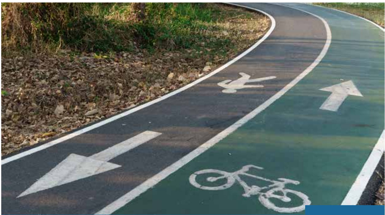
Bicycle path and a corridor for runners in the park

The review highlighted that trust and confidence in the current EPBC Act could be enhanced by the provision of transparent, independent advice on the adequacy of