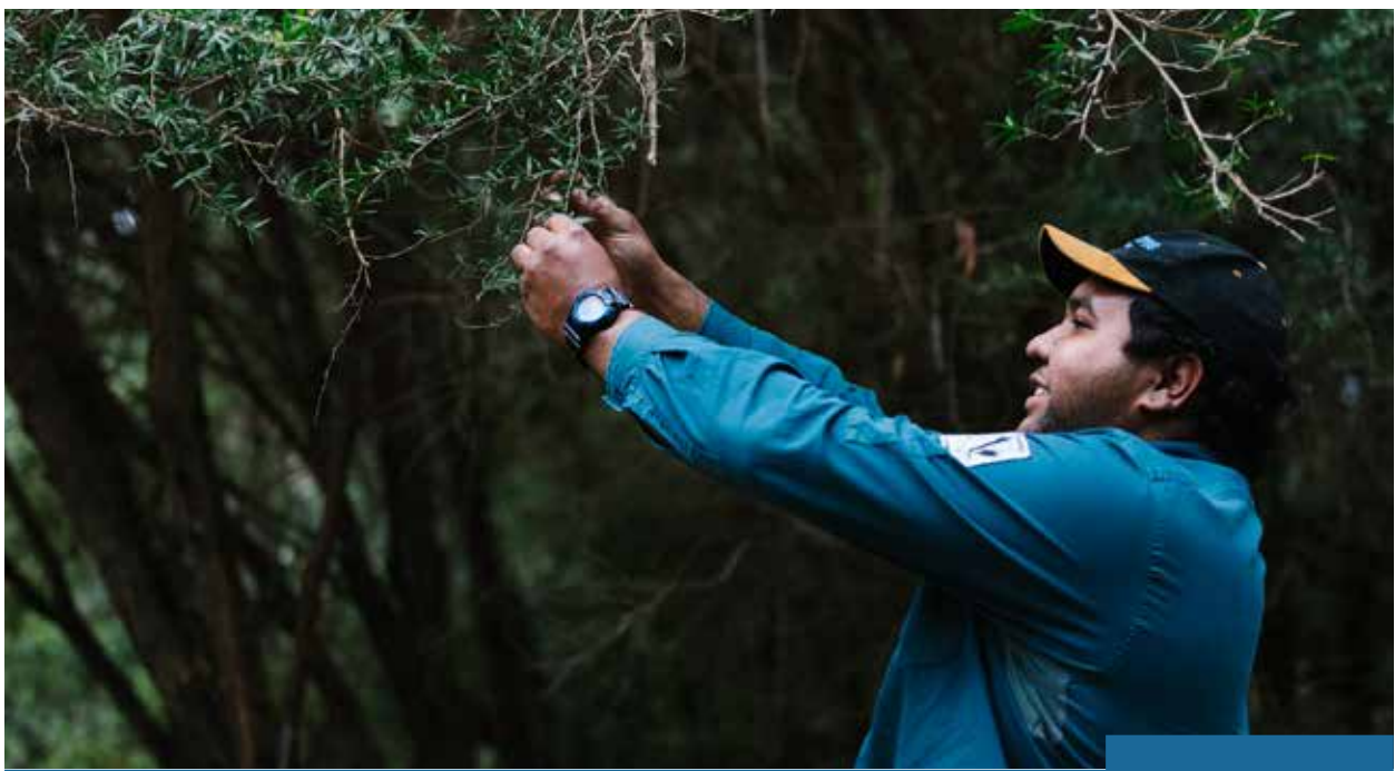
Indigenous Ranger

The government is committed to strengthening cooperation across the federation and will consider the best way to support this as part of future environmental policy and national law reform. The government is committed to reinvigorating important forums such as the Environment Ministers Meeting, to provide a platform to discuss strategic issues and agree cross-government actions to improve Australia's environment.