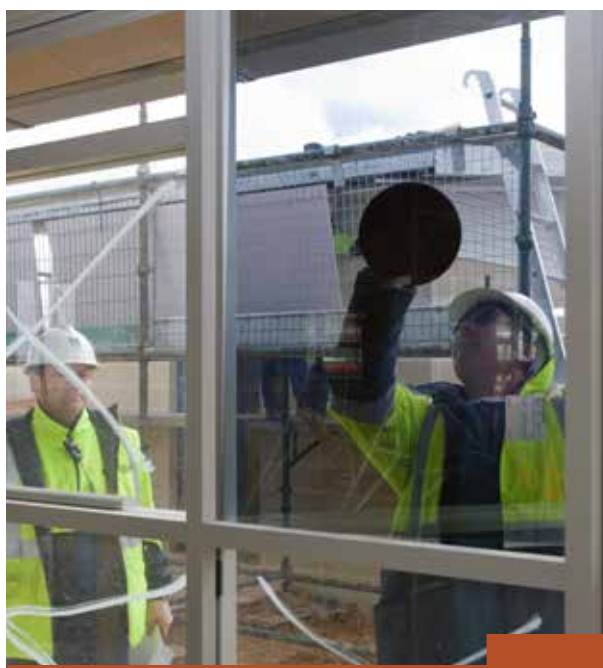
East Gungahlin School energy efficiency

Regional plans, strategic assessments and other strategic planning will be required to consider climate change and include environmental adaptation and resilience measures.