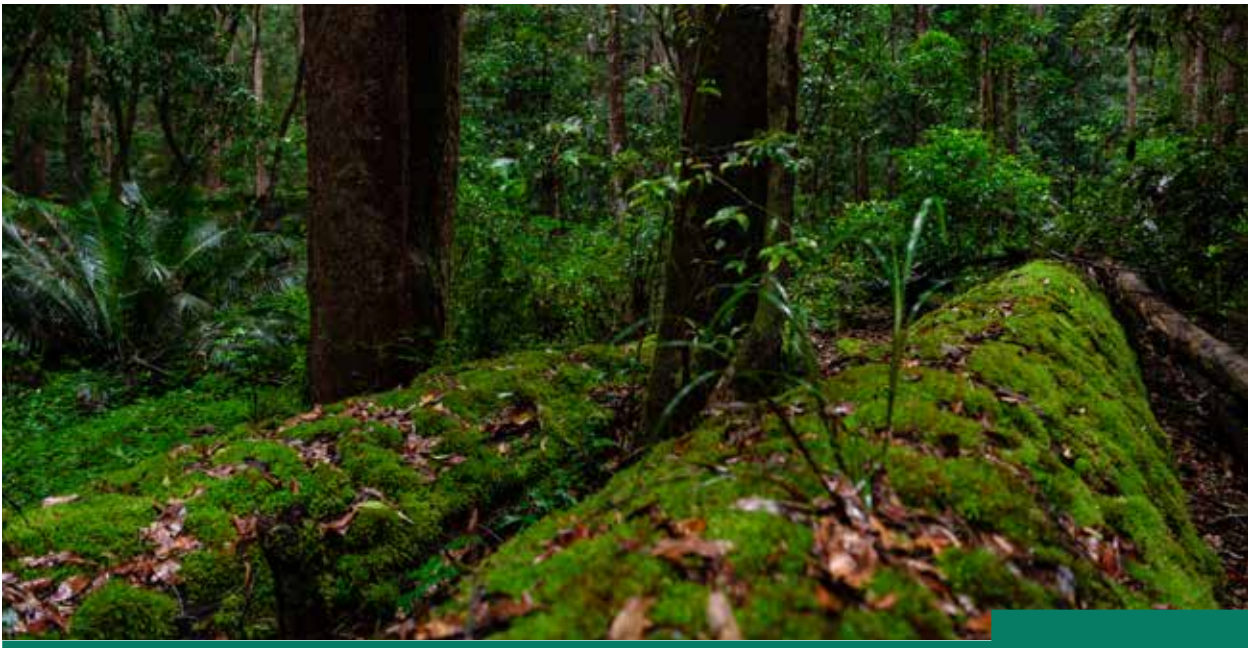
Rainforest, Fraser Island National Park