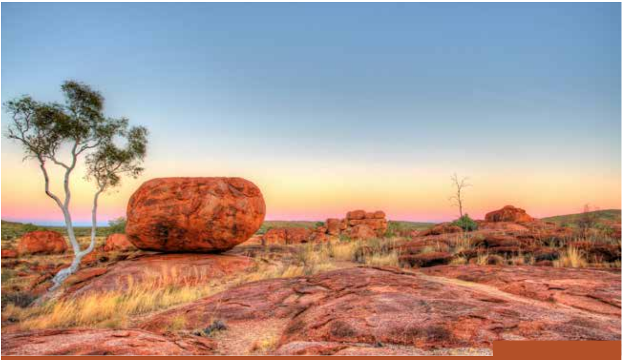
Karlu Karlu / Devil's Marbles Conservation Reserve