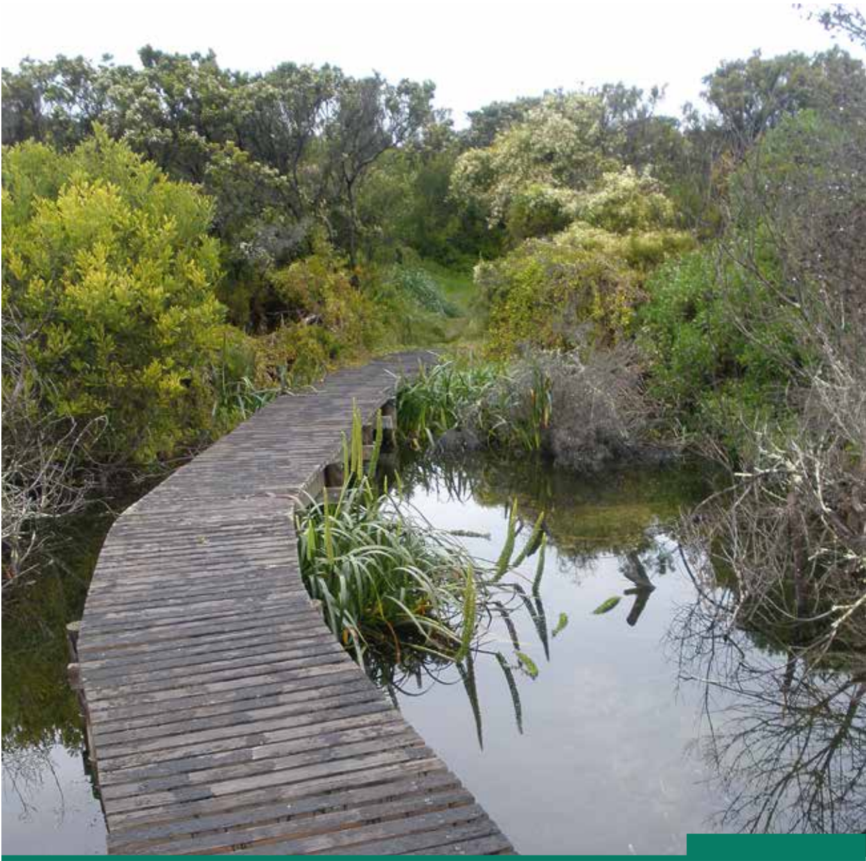
Bool and Hacks Lagoon.

The Government will reduce unnecessary prescription and administrative processes for wildlife trade permits, ensuring ongoing protection of species and consistency with international obligations. Excessive administration of the wildlife trade permitting process creates additional costs for individuals, businesses and government.