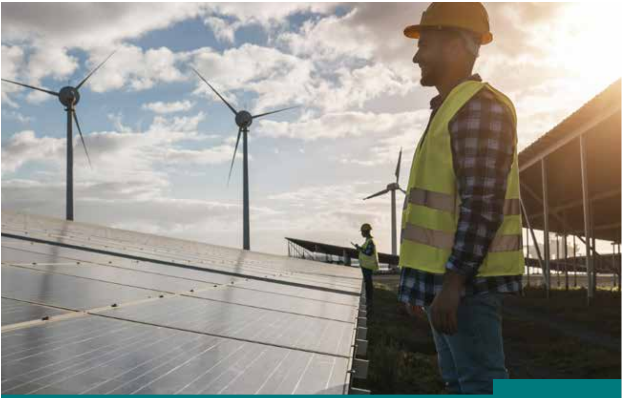
Renewable energy options

The government will work with stakeholders and relevant jurisdictions towards applying National Environmental Standards to Regional Forest Agreements to support their ongoing operation together with stronger environmental protection. The timing and form of this requirement will be subject to further consultation with stakeholders. Consultation will consider future management and funding opportunities under voluntary environmental markets.