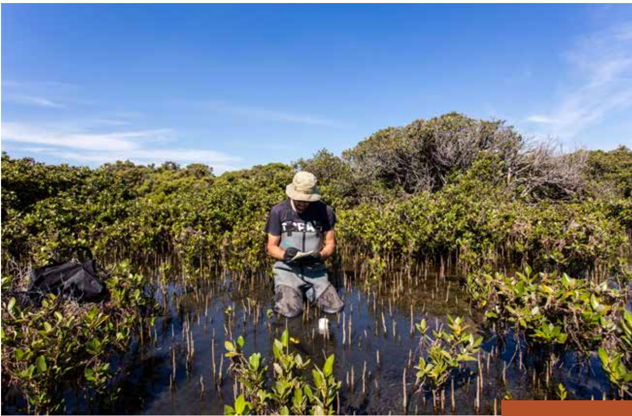
Scientist assessing carbon in sediment core

Restoring our natural environment will involve collaboration and engagement from all sectors, public and private, in partnership. We must work with all land managers, but particularly First Nations people, to turn around the trajectory of decline. The Australian Government recognises that First Nations peoples' participation in management of land and sea is crucial to environmental outcomes. Improving protection of First Nations cultural heritage and increasing opportunities to integrate and value First Nations' knowledge and participation in managing Australia's heritage and environment are important first steps.