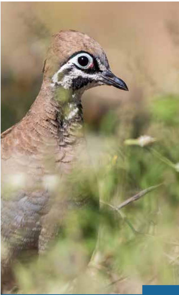
Squatter pigeon

The Australian Government recognises that to restore trust our national laws must establish clear standards and deliver nature positive outcomes. Decisions will be underpinned with quality data, transparently made by an independent agency, and subject to strong compliance and enforcement.