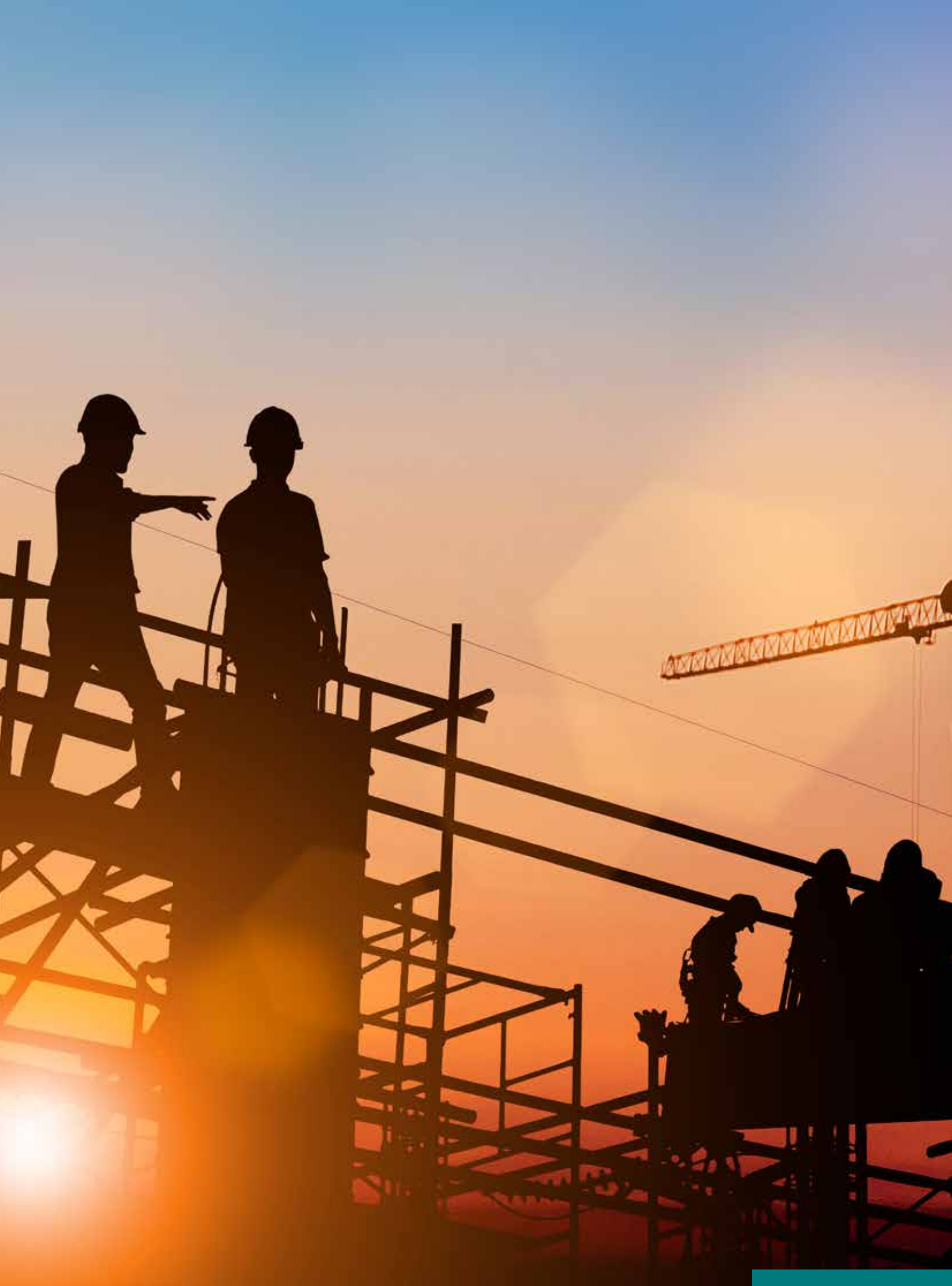
Workers at a construction site