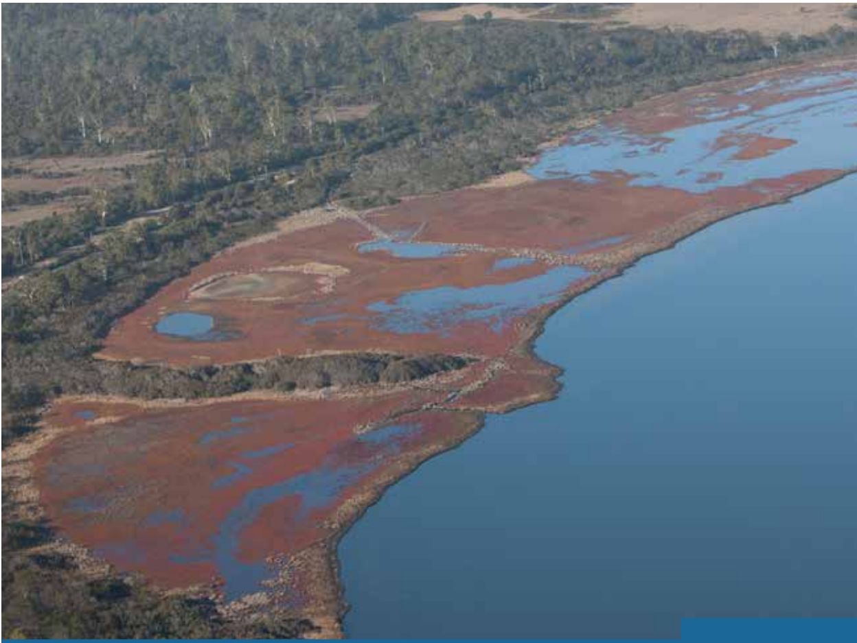
Moulting Lagoon, Ramsar Site

The Data Division will provide advice to the government on the establishment of the National Environmental Standard for Data and Information and be responsible for its implementation.