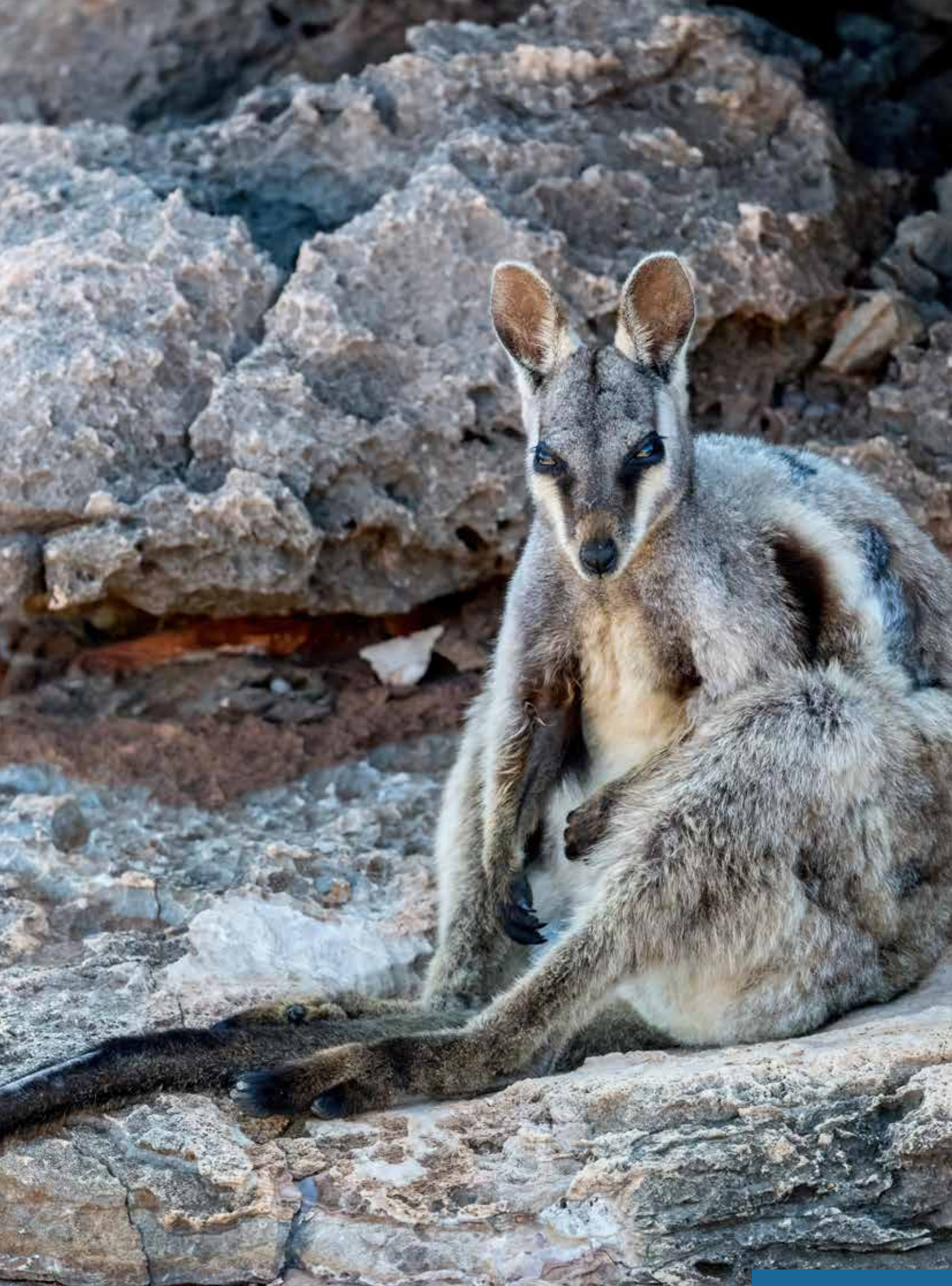
Black-flanked rock wallaby