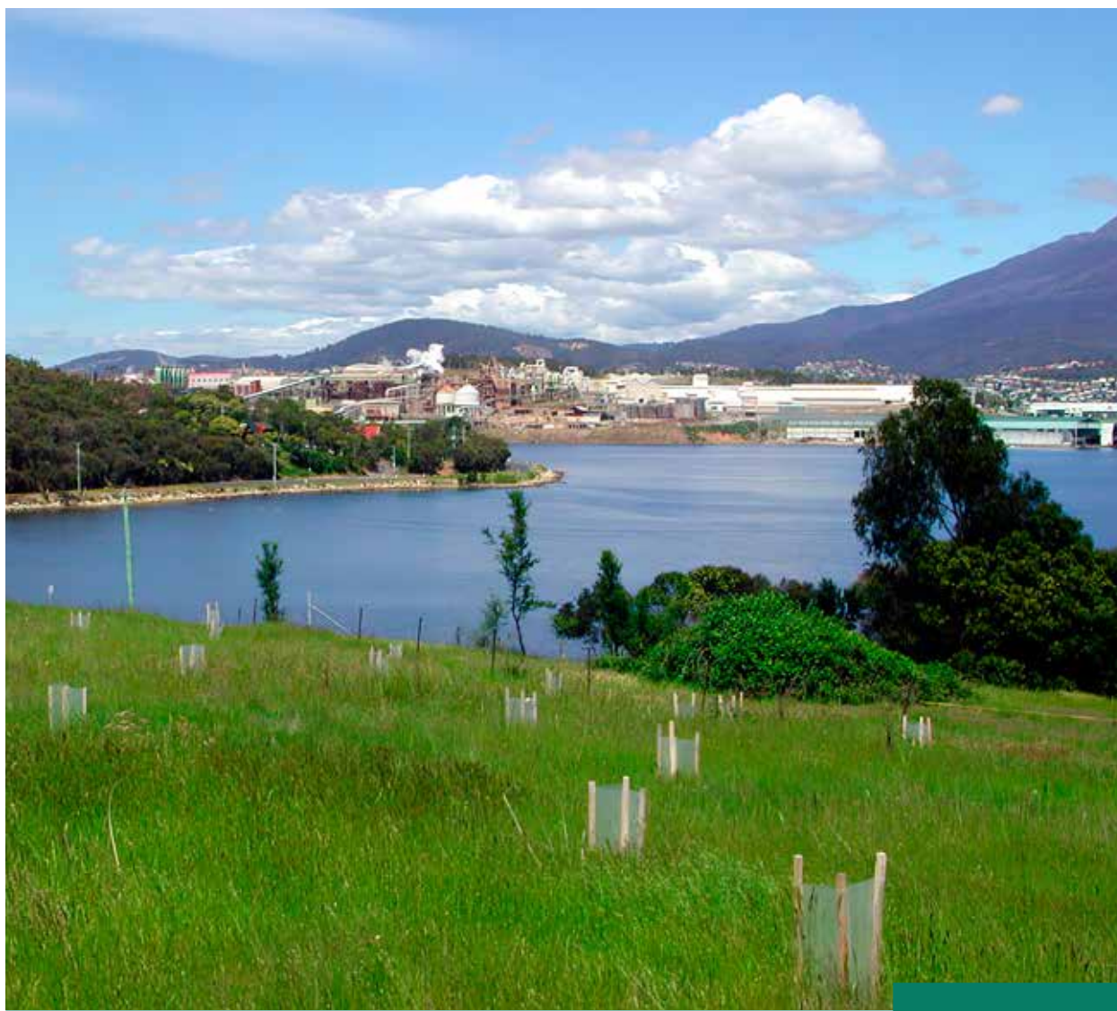
Revegetation area, Tasmania

Restoration activities are diverse and can have multiple goals. Restoration can include removing or managing threats, planting specific foraging trees missing from the landscape or improving ecological function (e.g. by re-establishing water flows). Restoration activities can also focus on improving the condition of remnant native vegetation or degraded land through removal of pests and weeds.